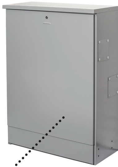
Door with EBR lock.

The riser can be taken back, left, or right.