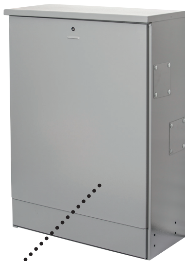
Door with EBR lock.

The riser can be taken back, left, or right.