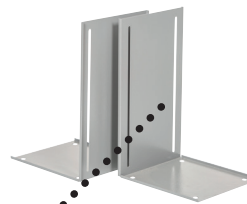
Raising legs for casting in concrete blocks.