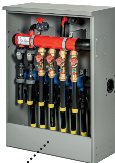
Detachable plate for easy installation.