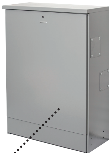
Door with EBR lock.

The riser can be taken back, left, or right.